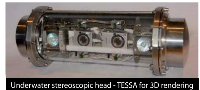
Underwater stereoscopic head - TESSA for 3D rendering