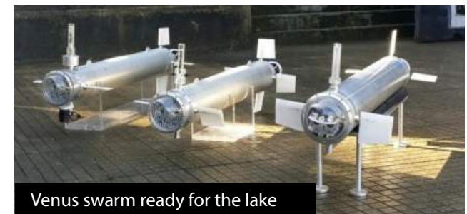
Venus swarm ready for the lake