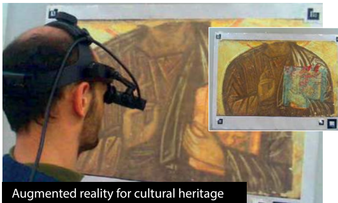
Augmented reality for cultural heritage