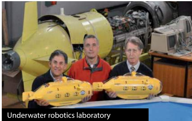
Underwater robotics laboratory