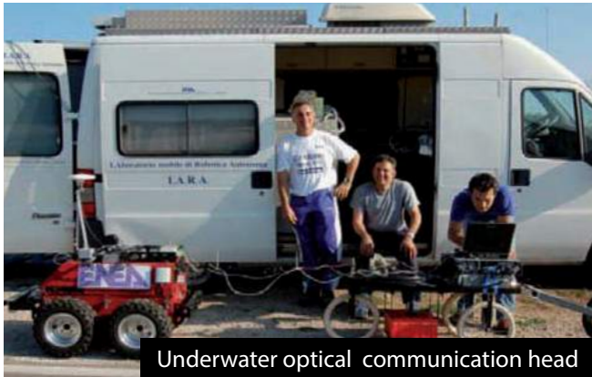
Underwater optical communication head