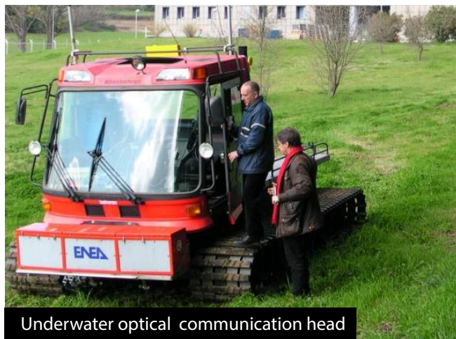
Underwater optical communication head