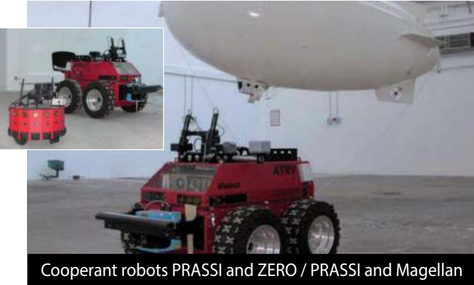
Cooperant robots PRASSI and ZERO / PRASSI and Magellan