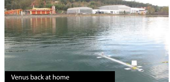
Venus back at home